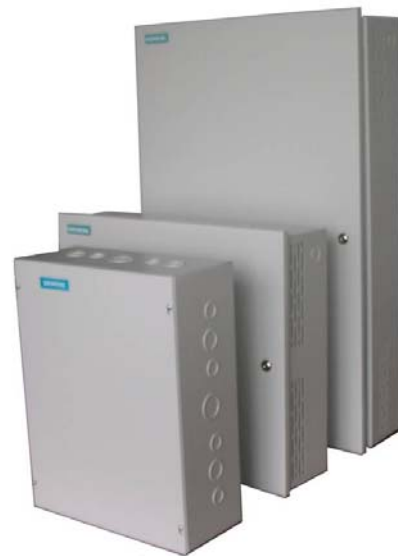
Figure 3. PX Series Enclosure Assemblies.

Service boxes are available for mounting in the 19" or 34" enclosures. Models provide step down power from either 115 Vac or 230 Vac to 24 Vac and offer protection against electrical transients. The service boxes are sized in various power ratings to provide one or two Class 1 Power Limited terminations for use inside the enclosure to power controllers and I/O modules, and one Class 2 termination for use outside the enclosure to power remote devices. The 115 Vac versions provide two 115 Vac outlets for accessory devices such as modems and laptops. Optional sidewall kits are available for service box installation in other NEMA Type 1 or better enclosures such as motor control cabinets.