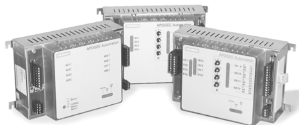
Figure 4. Analog and Digital Point Expansion Modules.

The digital inputs are dry contact with four of the inputs being pulse accumulator points. The relayed digital output points support 110/220V Form C relays.