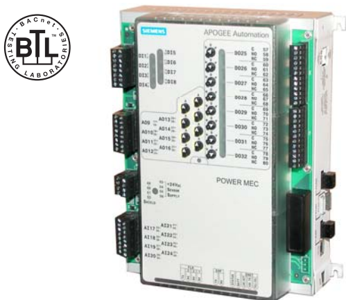
Figure 1. Power Modular Equipment Controller.